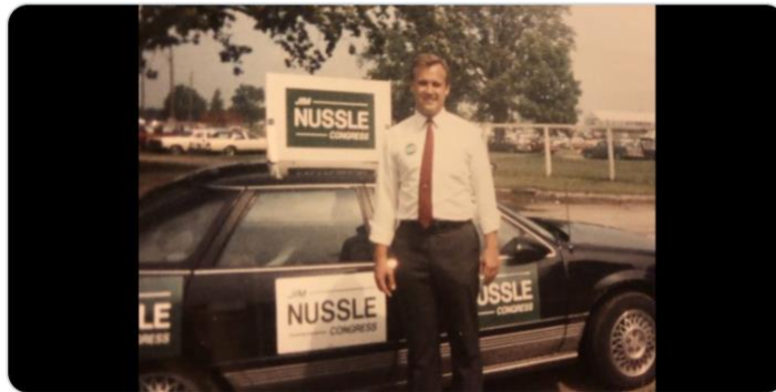
7:46 PM · Jan 6, 2021 · Twitter for iPhone

I will no longer claim I am a Republican tonight as I am outraged and devastated by the actions of too many elected Republicans (some I know and served with) and supporters. Today a final line was crossed that I will not excuse. The GOP is NO more and left me and others behind.